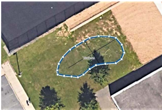
Satellite view of proposed garden position.

Rain gardens can be a relatively simple solution for developed areas that are prone to flooding, which is a common problem after a rainstorm. Downspouts from roofs and overland flow across a property can cause runoff that would eventually lead to storm drains. The rainwater carries pollutants and deposits them into nearby creeks, streams, ponds, wetlands, and coastal waters. Rain gardens are strategically placed to intercept pollutant laden stormwater runoff until it can be fully absorbed into the ground; making them a great way to help improve water quality.